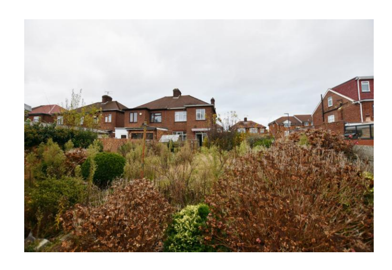
EPC to Follow

Illustration for identification purposes only, measurements are approximate, not to scale. David Conway © 2021 (ID 789595)